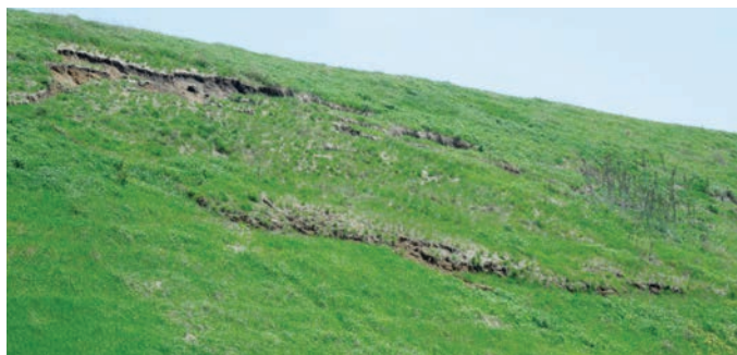
Figure 1 - Slope Failure

A slope becomes unstable causing a soil mass to mobilize when the shear stress acting on the soil becomes greater than the shear strength of the soil. There are many factors that can affect the shear strength of soil and many circumstances can place additional shear stresses on soil. Due to the large amount of variables impacting the stability of a slope it is almost impossible to find the sole cause of slope mobilization. The implementation of measures to correct one or two key failure mechanisms, however, has been effective in slope stabilization. While erosion, the detachment, transportation, and deposition of soil particles, can be a factor affecting slope stability it must be differentiated from slope failure, the mobilization and sliding of a large soil mass (Figure 1).